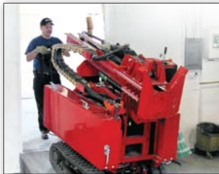
Gain access to sampling sites thru standard 36 inch doorways.

For those who need even more out of their rig, a 1,000 ft-lb. hydraulic auger drive head can be added to 9100-VTR models to allow for hollowstem augering. A variety of additional upgrade options and accessories are available so you can configure the unit to match your specific needs. Contact your AMS representative for more information.