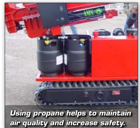
Using propane helps to maintain air quality and increase safety.