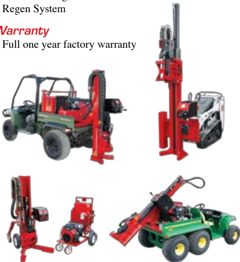
Skid, ATV, Ag-Probe and P-model 9100 Series PowerProbes™ are also available.