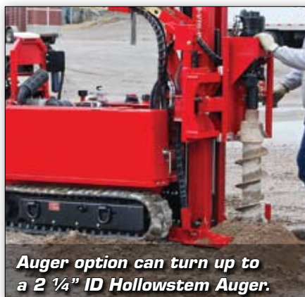
Auger option can turn up to a 2 1/4" ID Hollowstem Auger.