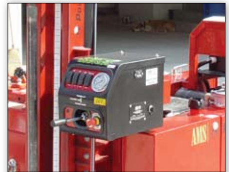
Control Panel with up-down, side-to-side, tilt, and emergency stop.