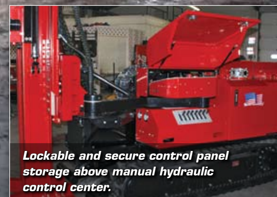
Lockable and secure control panel storage above manual hydraulic control center.