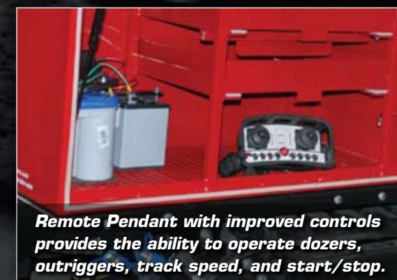
Remote Pendant with improved controls provides the ability to operate dozers, outriggers, track speed, and start/stop.