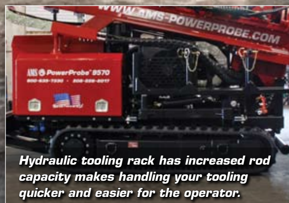
Hydraulic tooling rack has increased rod capacity makes handling your tooling quicker and easier for the operator.