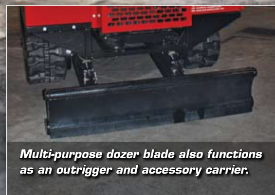
Multi-purpose dozer blade also functions as an outrigger and accessory carrier.