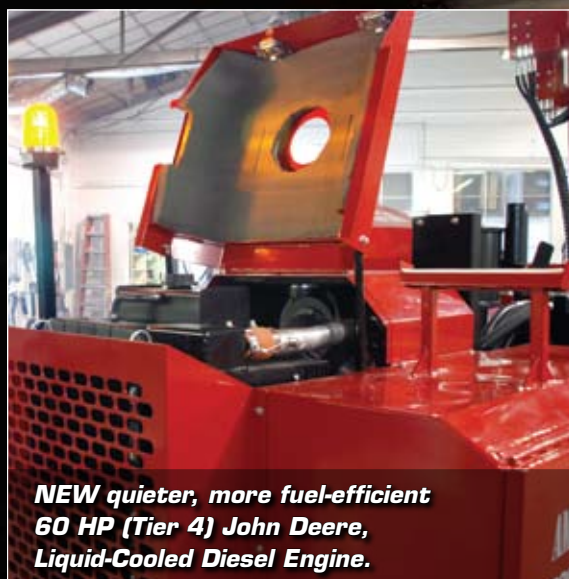
NEW quieter, more fuel-efficient 60 HP (Tier 4) John Deere, Liquid-Cooled Diesel Engine.

A more ergonomic, water-tight control panel with pivot-put-away option allows the user to run all functions from one location. It includes engine controls, auto-drop hammer and speed controls, and a new digital display that shows the user instant engine operating levels.